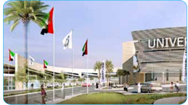
University of Dubai New Campus | Dubai Academic City | Operational by Fall 2015